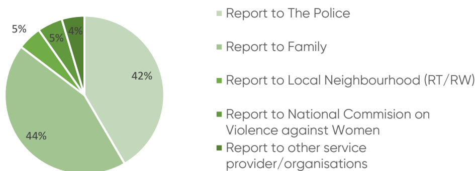
Chart 2.1 Options for Reporting Sexual Violence Report on the Quantitative Study of Gender Equality Barometer 2020

The Quantitative Study Report of the Gender Equality Barometer 2020, conducted on 2,210 respondents, shows that the majority of respondents (93.4 percent) are aware of where to report incidents of sexual violence. 80 However, among those who know where to report, 43.8 percent choose to report to the police as their first point of contact, 41.6 percent report to their family, 4.9 percent report to their local neighborhood association (Rukun Tetangga or Rukun Warga/RT or RW), and 4.6 percent report to other entities such as legal aid organizations or other service providers. 81