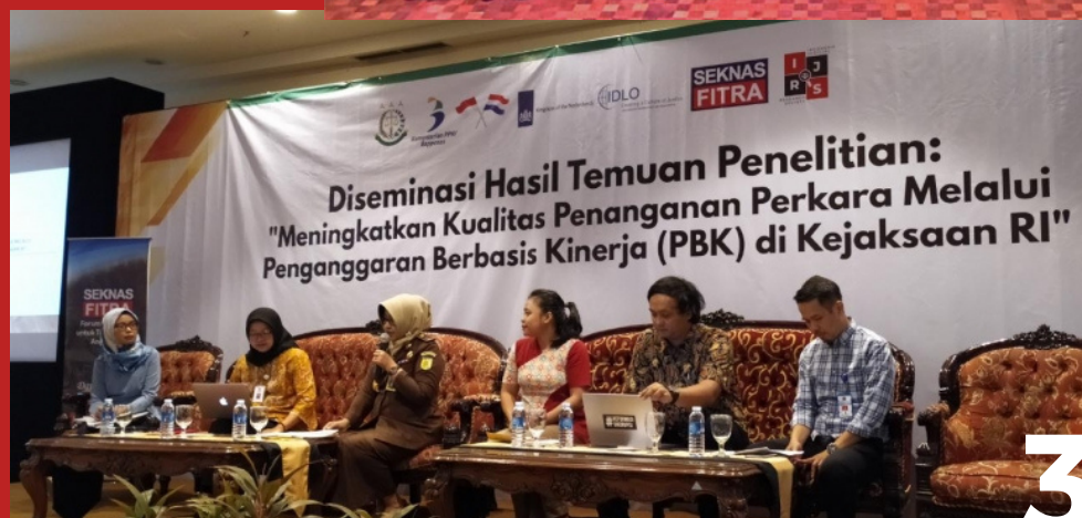
Diseminasi Hasil Temuan Penelitian: "Meningkatkan Kualitas Penanganan Perkara Melalui Penganggaran Berbasis Kinerja (PBK) di Kejaksaan RI"