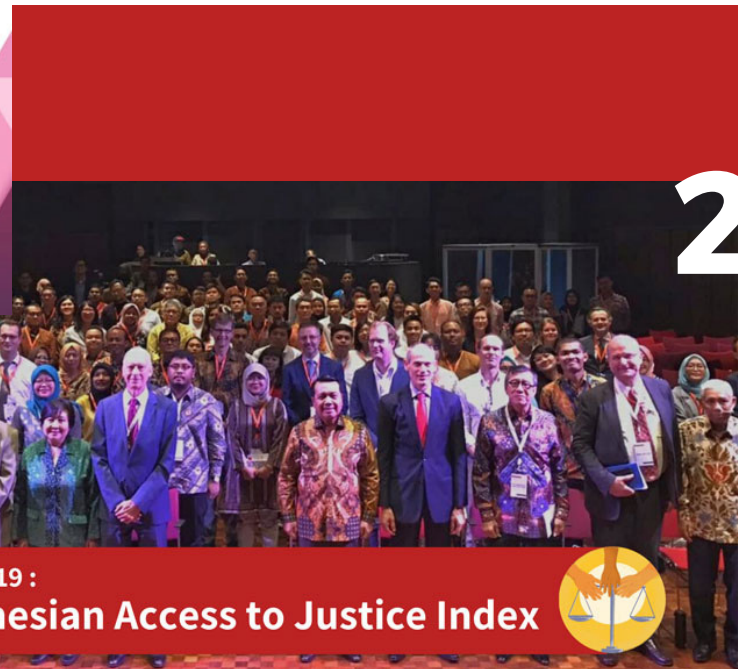
INLU 2019 : Indonesian Access to Justice Index